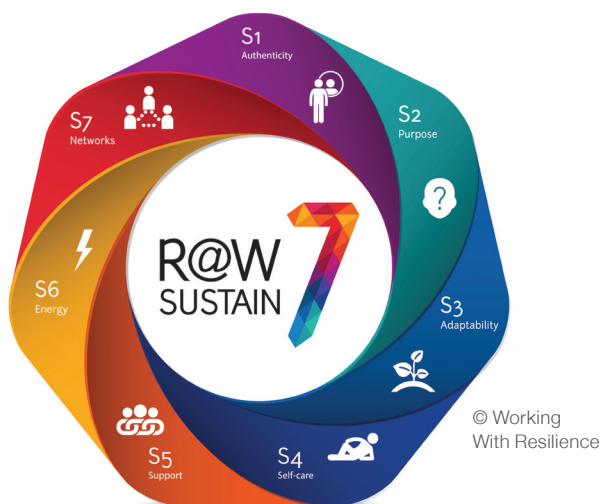
Figure 2: R@W® Individual Model

The R@W Individual model, also known as the Sustain 7 (Figure 2), has seven components (resources) that contribute to our personal resilience. Neuroscience tells us the more resources we have, the better equipped we are to manage both adverse situations and everyday demands. The idea is then that we invest in as many of the seven components as we can.